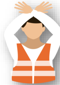
Stop I need support

Marshals are the means of controlling safety on a stage and will often be in the front line if an incident happens.