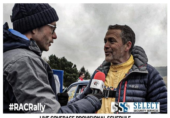
LIVE COVERAGE PROVISIONAL SCHEDULE THURSDAY

START H&H 15:00 SS2PC KERSHOPE 18:00 SS4PC KERSHOPE 19:56